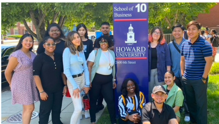
2022 ASDP Participants commemorate their successful case study presentations and the end of a dynamic week of learning about the accounting profession.

One of the participants commented, " My main takeaway is that we were unaware of so many opportunities for community college students. I'm also more familiar with what accounting is and why it truly is the language of business." Furthermore, all of the participants confirmed that ASDP offered the right mix of sessions and provided valuable insight on how to seamlessly transfer to a four-year institution.